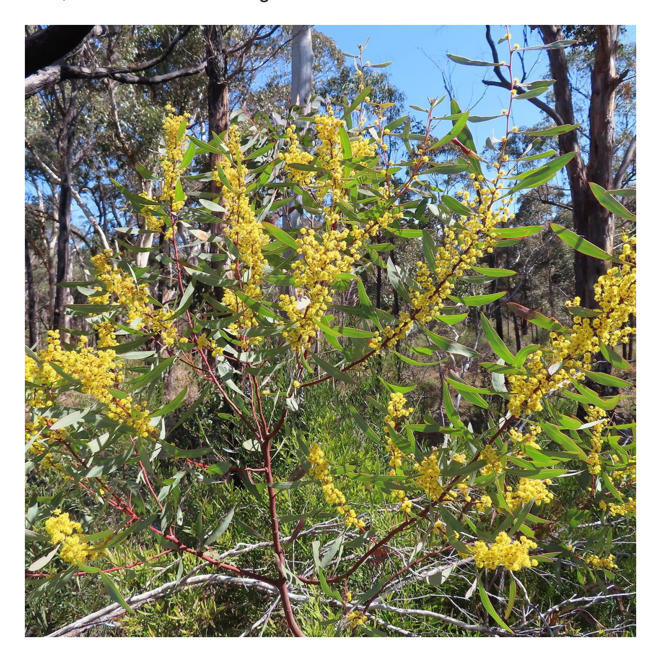
Flowering wattle - Cath Carkeet