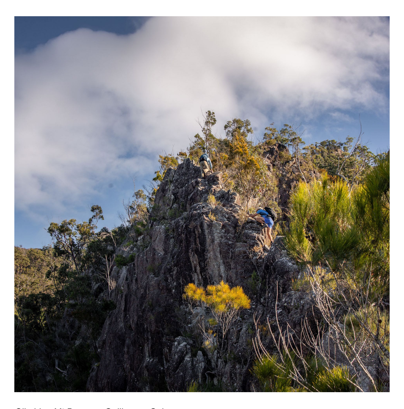
Climbing Mt Barney - Guilherme Salum