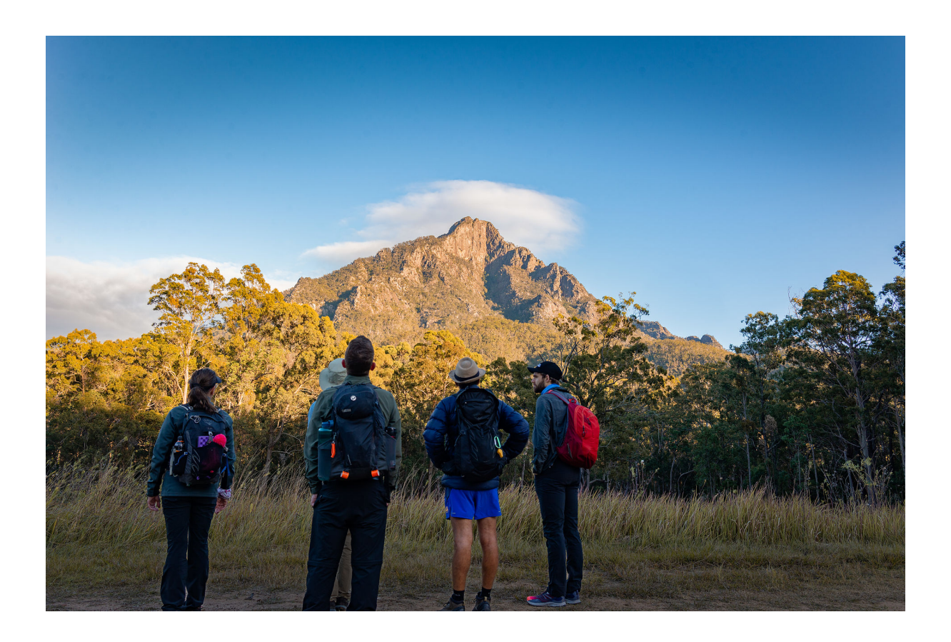
View to Mt Barney - Guilherme Salum