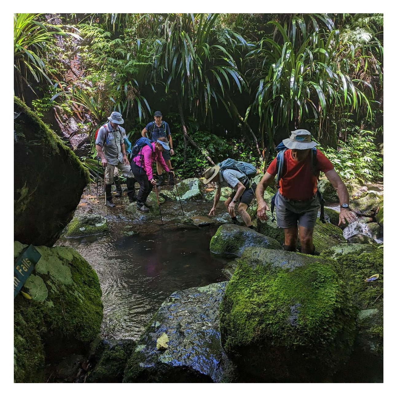
Tooloona Circuit - Nick Brooking