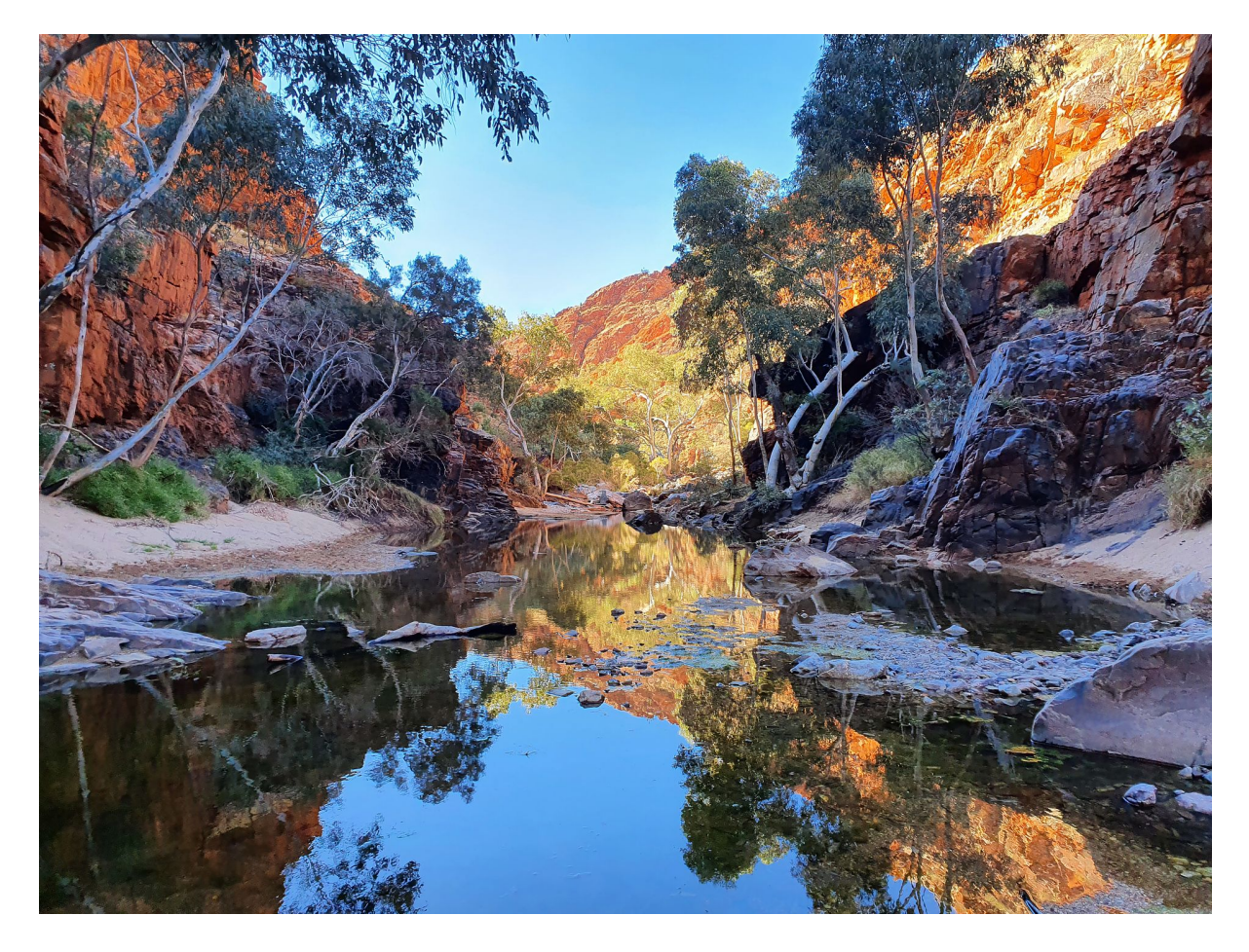
Photographic competition Runner Up People's Choice - Hugh Gorge, Larapinta Trail - Shannon Bratton