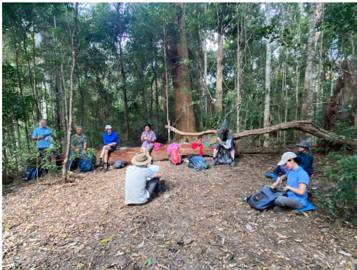
The September Leaders weekend - Gerry Burton