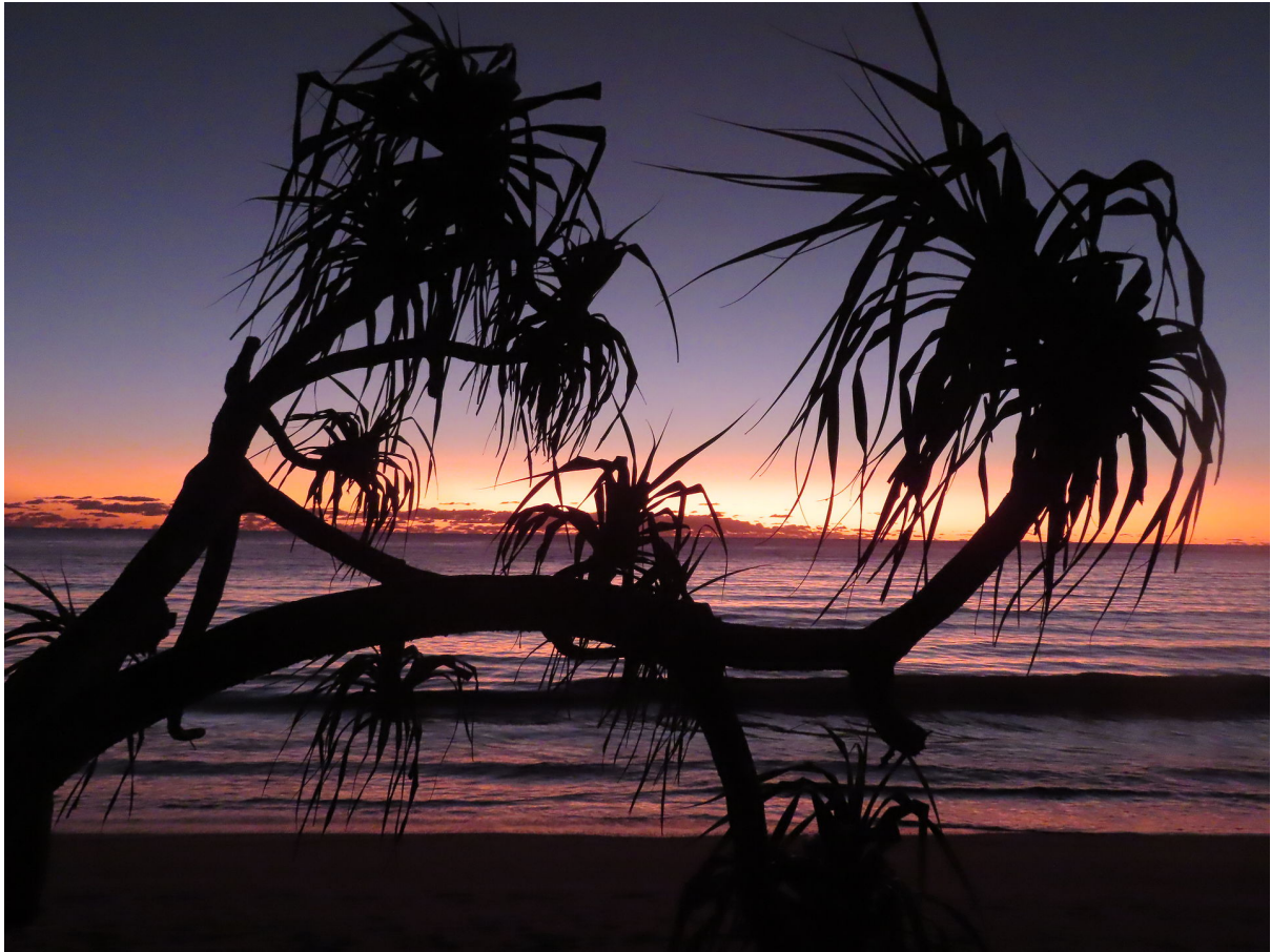
Sunrise at Little Ramsay Bay (Hinchinbrook Island) - Cath Carkeet