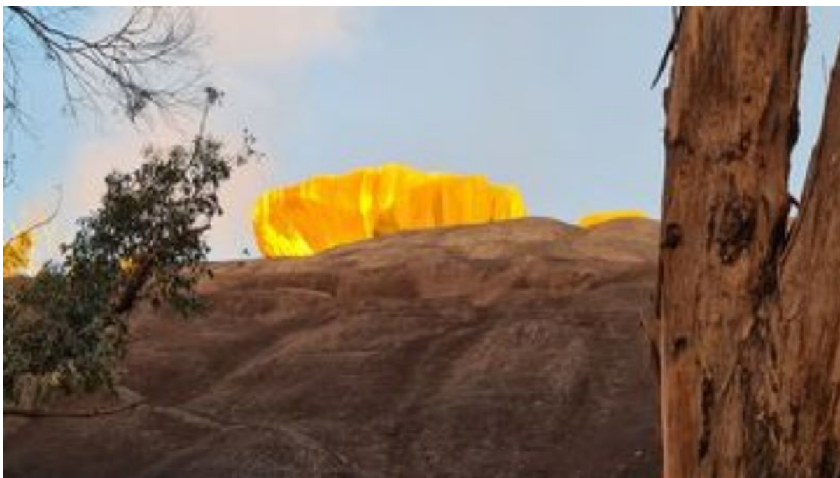
Sunset on South Bald Rock