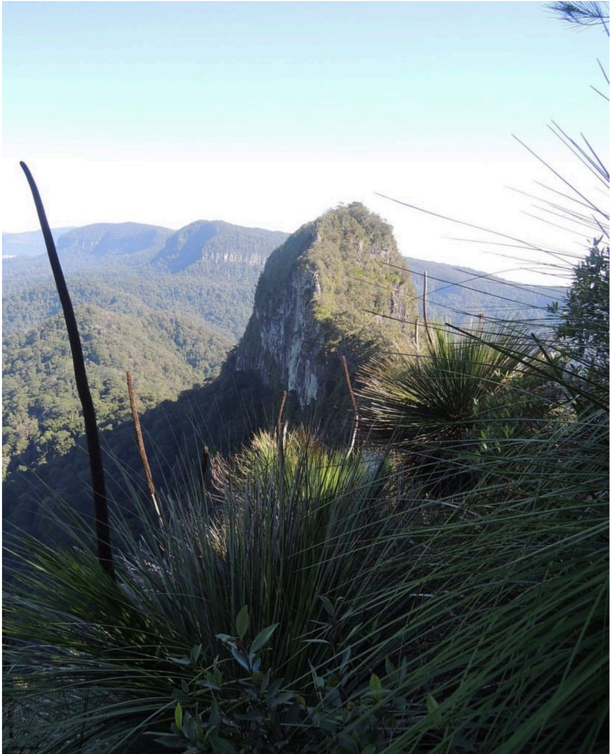
Grass trees - Greg Kuss