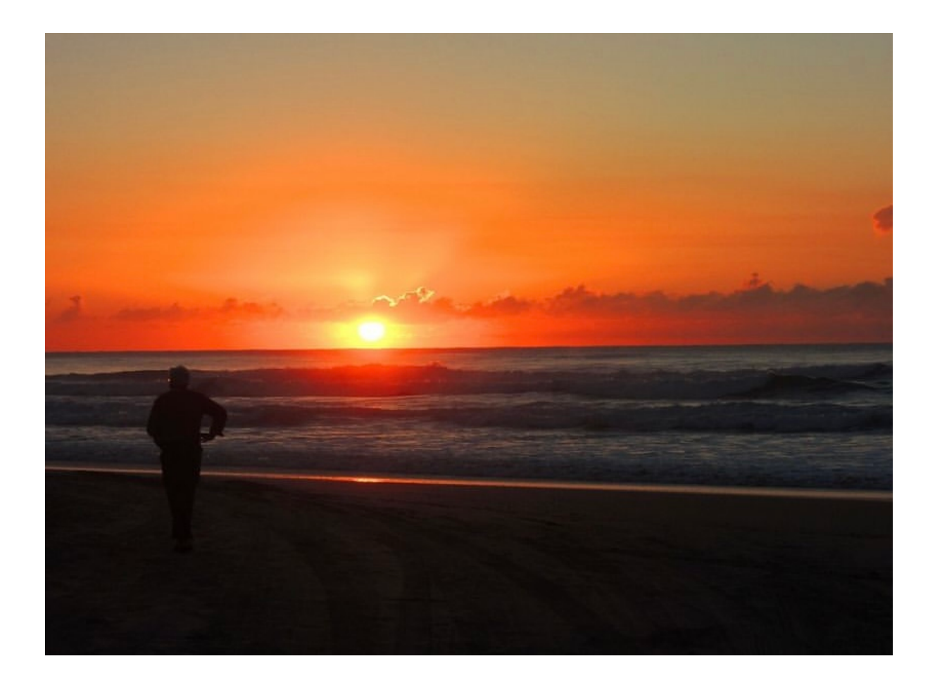
Sunrise Anzac Day 2022- Greg Kuss