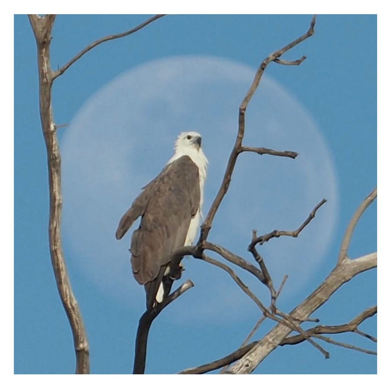
Sea Eagle against the setting moon - Paul Camp