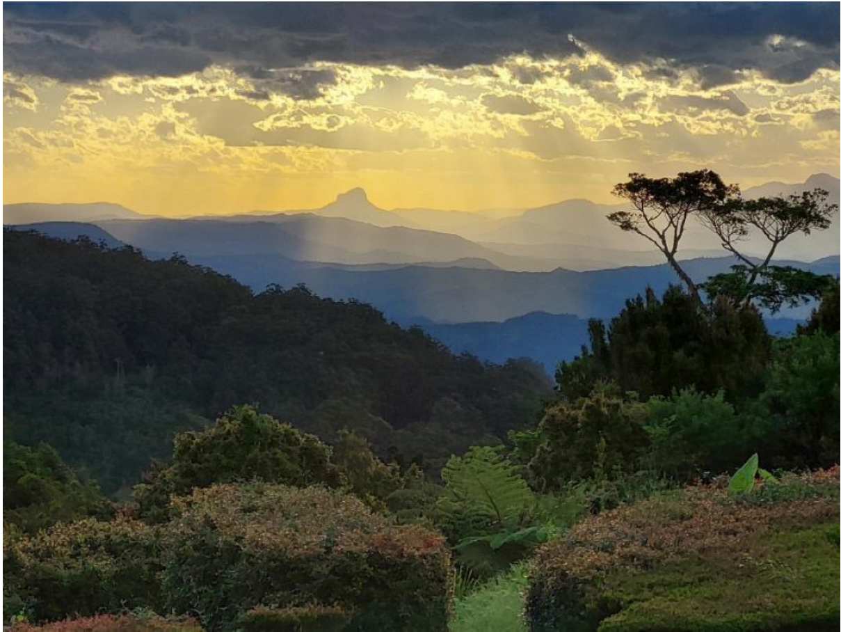
View from O'Reillys to Mt Lindsay - Katie Lee